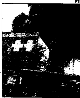
The blast killed 34 people and left more than 60 injured

As a tradition, the celebration would have seen all its 20 power plants across the country, including the Unchahar power project, getting all their units lit up and working to their full ca-