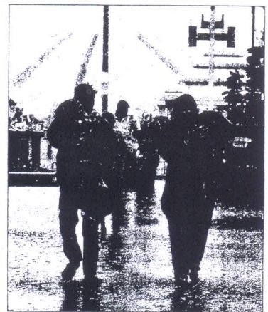
Residents walk through the rain in Chennai as cyclone Vardah makes landfall on Monday.

Home Minister Rajnath Singh spoke to the chief ministers of Tamil Nadu and Andhra Pradesh and promised all help.