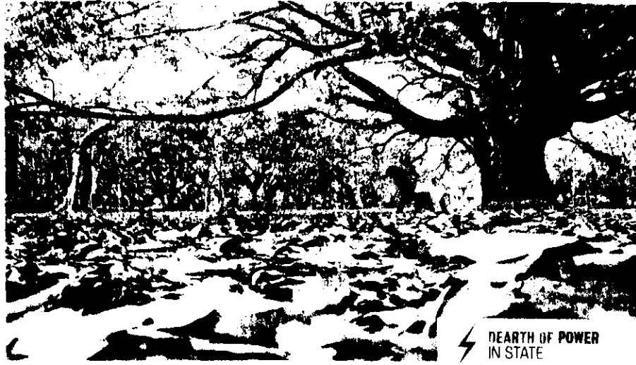
DEATH OF POWER IN STATE

Even as temperatures sizzled across the state, parts of the state had some respite owing to showers. Moderate to light showers were recorded in five districts (as of 9 pm), on Wednesday. During the day, there was rainfall in several parts of Chikmagalur district, with the district centre receiving 56 mm. Davangere district too received showers, with Channarayana taluk recording 19 mm rainfall. Parts of Hassan taluk, Peryapatna taluk in Mysuru district and Theerthahalli in Shivamogga district received light showers during the day.