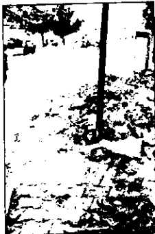
TALKING OF BASICS