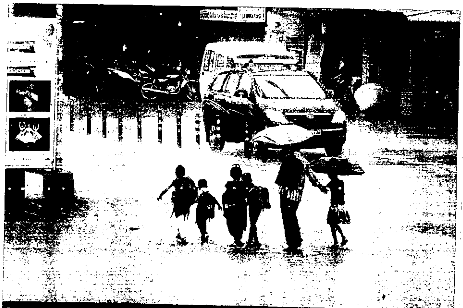
DRENCHED: Children walk in the rain in Chikkamagaluru as the town received its first showers of the season on Wednesday.