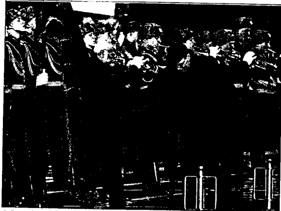
A Russian official nudges Prime Minister Narendra Modi as he walks past a guard of honour even as the Indian national anthem was being played during his arrival at Vnukovo-2 Airport in Moscow on Wednesday.

"India-Russia bilateral trade last year was worth a shade below $10 billion. Both New Delhi and Moscow acknowledged that the trade was far below potential. "There is potential to further strengthen our rela-