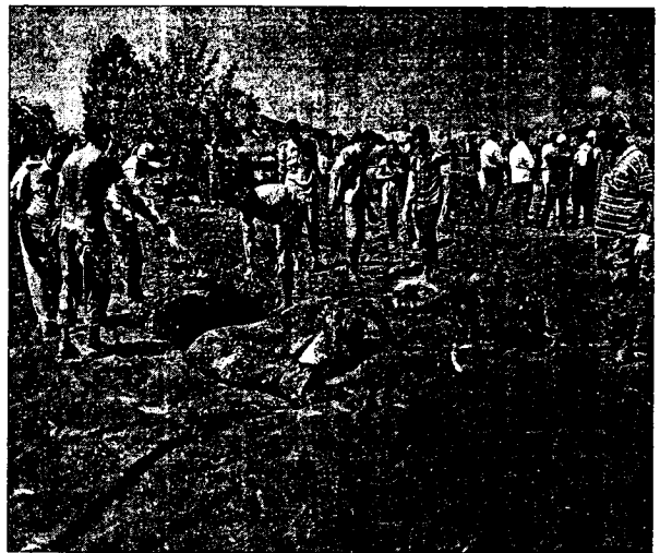
Forest personnel on Wednesday exhume the carcass of an elephant that was buried in a 15-foot-deep open well at Selvipura village in Kollegal taluk, Chamarajanagar district.