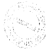
Chairman CSR Committee BESCOM

The Board of Directors on its own and/or as per the recommendations of CSR Committee can amend this policy, as and when required as deemed fit. Any or all provisions of the CSR policy would be subject to revision/amendment in accordance with the regulations on the subject as may be issued from relevant statutory authorities, from time to time.