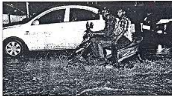
A motorcyclist navigates through a waterlogged road in the City on Friday.

received complaints of water gushing into houses at Vasanthapura, Uttarahalli Main Road and Konanakunte in Bengaluru South.